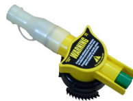
NO-SPILL NOZZLE ASSY.