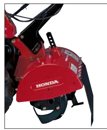
ADJUSTABLE DEPTH BAR This convenient feature lets you change the tilling depth.