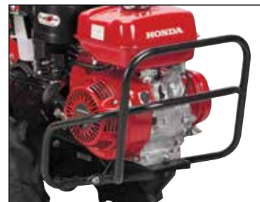
RUGGED FRONT GUARD Protects the engine and transmission.