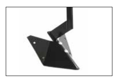
HILLER/FURROWER Increases garden productivity by quickly creating raised beds and planting/irrigation ditches.