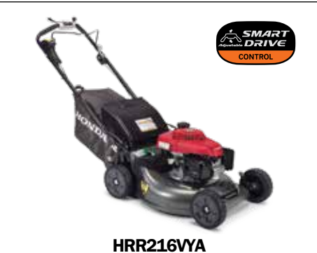
Honda adjustable, variable speed Smart Drive; Auto Choke with Adjustable Throttle Control; Roto-Stop® Blade Stop System; 3-in-1 system with Clip Director®