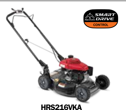
Honda adjustable, variable speed Smart Drive; side discharge/mulcher with Auto Choke