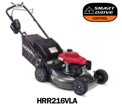
Honda adjustable, variable speed Smart Drive; Auto Choke; 3-in-1 bag, mulch, or discharge with Clip Director®; self charging Electric Start