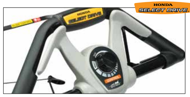
Honda Select Drive® System