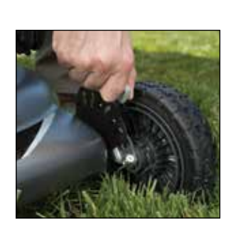
Height Adjustment System Six or seven adaptable mowing height adjustments from 3/4" to 4" (depending on model) to suit your particular mowing needs.