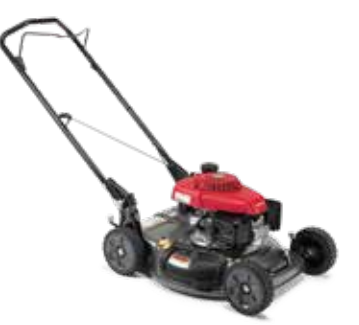
HRS216PKA Push type, side discharge/mulcher with Auto Choke