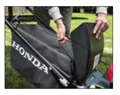
Easy On/Off Grass Bag Our HRR and HRX model grass bags make it easier than ever to empty clippings, saving you time and effort. An optional low dust bag is available for HRX models.