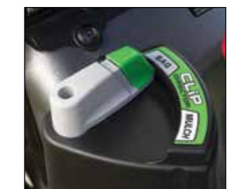
4-in-1 Versamow System With Clip Director® Mulch, bag, rear discharge or leaf shred with no parts to lose and no tools required. (HRX only)