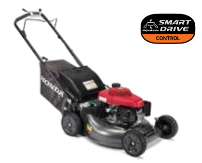
HRR216VKA Honda adjustable, variable speed Smart Drive; Auto Choke; 3-in-1 bag, mulch or discharge with Clip Director®